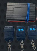
Remote Control set