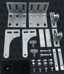
Spare Part set

2 sides parts (Wall/Pillar + Triangle bracket + small gate mounted), stopper, screw and nuts