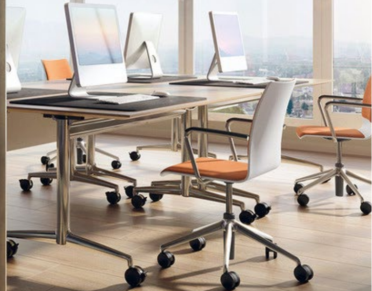
Picture shown is for illustration purposes only. Actual products may vary due to product enhancement.